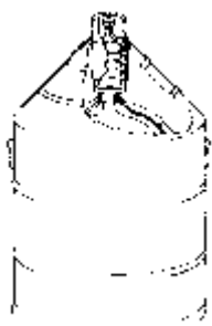
Fig. 1 A typical dewar.

Containers are designed and manufactured according to the applicable codes and specifications for the temperatures and pressures involved.