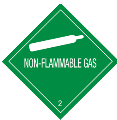
Fig. 4 Nonflammable gas shipping label.

The hazards associated with liquid nitrogen are exposure to cold temperatures, which can cause severe burns; overpressurization due to expansion of small amounts of liquid into large volumes of gas in inadequately vented equipment; and asphyxiation due to displacement of oxygen in the air in confined work areas.