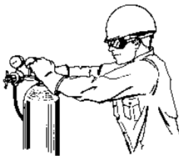
Figure 2 The correct way to safety check a system

Because oxidizers change the chemistry of fire, a material that does not burn in air may ignite or react violently in an oxidizer atmosphere. Equipment used in oxidizer service should be selected with materials of construction that minimize the probability of ignition and the risk of fire or explosion. This equipment must be cleaned to remove any contaminants such as oils or grease. Care must also be taken to eliminate any residual cleaning agents. Regulators used in oxygen service should be maintained exclusively in oxidizer service. If a regulator is used in other types of service, it may no longer meet oxidizer clean requirements.