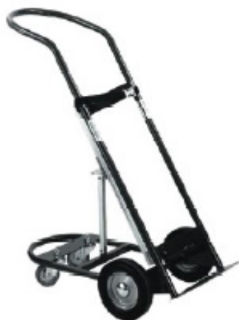
Typical cylinder hand trucks