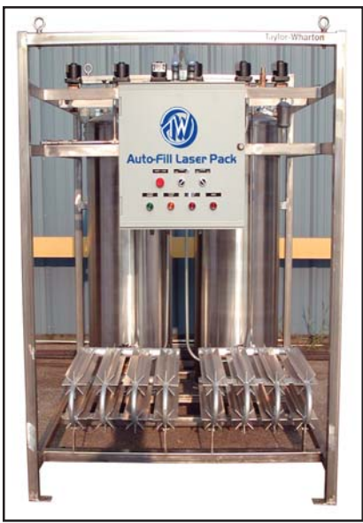
Taylor-Wharton's auto-fill laser pack is completely weatherized and the all stainless steel plumbing adds additional protection against hostile elements.

Taylor-Wharton's LNG bulk storage tanks are available in configurations for both fuel-station and infrastructure applications, in vertical and horizontal designs with capacities from 1500 to 100,000 gallons. Standard features include top and bottom fill lines and a dual safety relief system. Options include a pressurebuilding coil and economizer circuit and submerged transfer pumps.