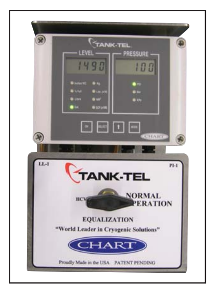
Chart recently introduced Tank-Tel, a telemetry-ready unit, which calculates level and pressure—no need to consult a calibration chart.