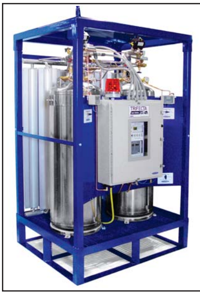
Chart recently introduced a new generation Trifecta, a 500-psi pressure-boosting module for its standard tanks, designed for laser-cutting assist gases.

Chart's Tim Neeser, director of marketing and new product development, notes a similar uptick in high-pressure bulk-gas sales.