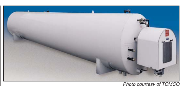
CO<sub>2</sub> Storage unit with capacities from six tons to 120 tons. New tanks for CO2 are now made of steel alloys designed for increased toughness and less likelihood of embrittlement.

New tanks for CO2 are now made of steel alloys designed for increased toughness and less likelihood to become brittle. TOMCO and other suppliers use SA-612 steel, normalized to optimize toughness. TOMCO offers several different models and sizes of CO<sub>2</sub> storage units. The The 50-ton single-walled Vertical CO. single walled units are urethane Tank. "A 50-ton tank is ideal since insulated which is highly the gas companies can drop an efficient even in areas of high entire 22-ton load from their transports into the larger tank," said heat and humidity. These units Dan Templeton, TOMCO vice are available with or without president of sales and marketing for refrigeration, as are the double-