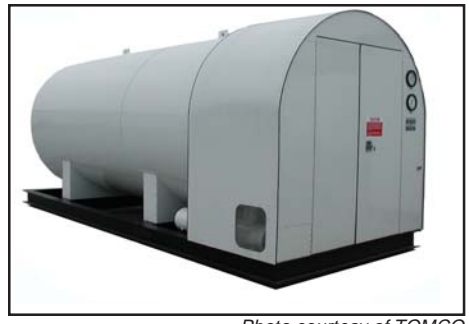
The CO<sub>2</sub> storage unit (six tons to 120 tons capacity) with wide flanged rectangular skids for balanced weight distribution in areas where placement is a concern.

A couple of other markets have grown recently for CO_2 , boosting the coffers of TOMCO and other suppliers of CO_2 bulk tanks. "We've seen a noticeable increase in the need for capacity from municipality water plants," says Templeton, where CO_2 is used for pH control. "And, poultry plants have been a growing market for